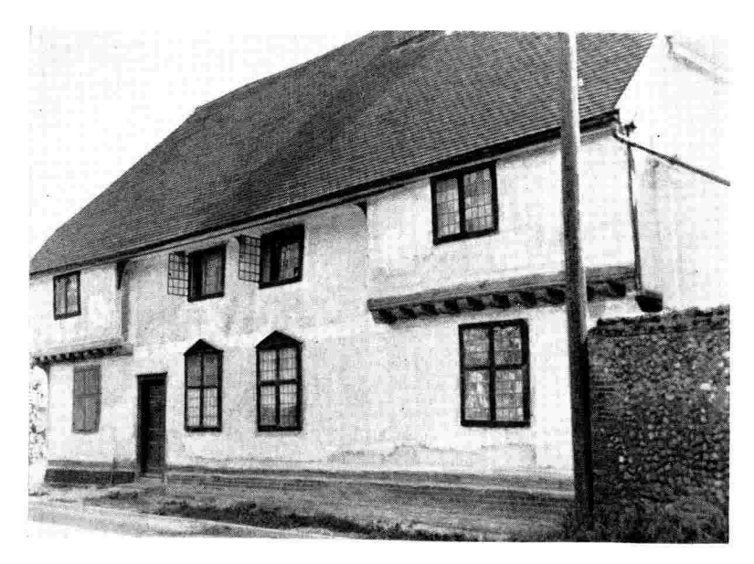
Dover House, Ixworth; front.